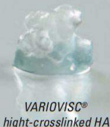
VARIOVISC® high-crosslinked HA